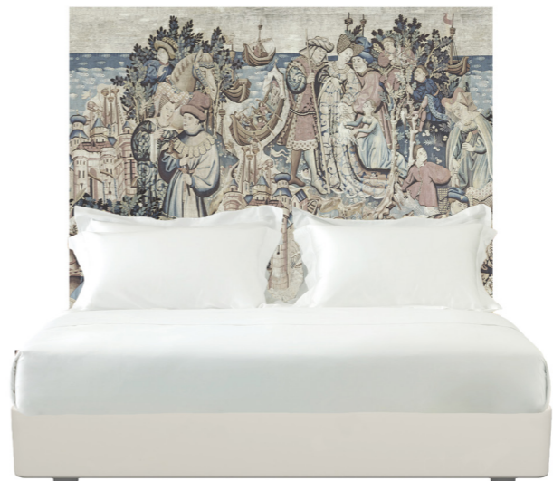
Example shown on a UK Super King size bed (180 cm wide)

Devonshire Swans Colour: Hemlock Blue Clay Product Ref: ZF.0288.25