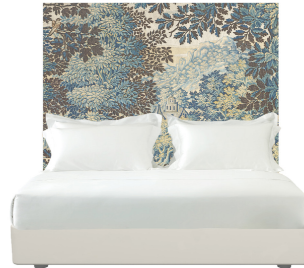
Example shown on a UK Super King size bed (180 cm wide)

Hardwick Verdure with Swans Colour: Classic Product Ref: ZF.0285.01