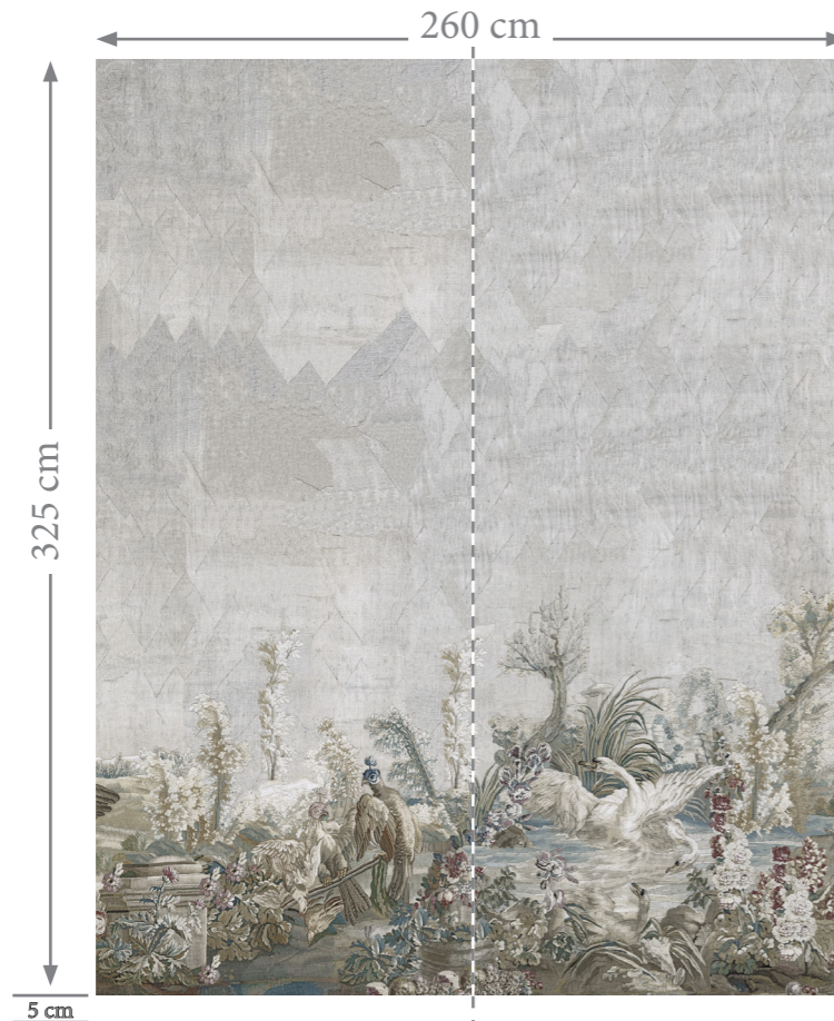
Drop A Drop B Hawks & Swans ZF.0245.12