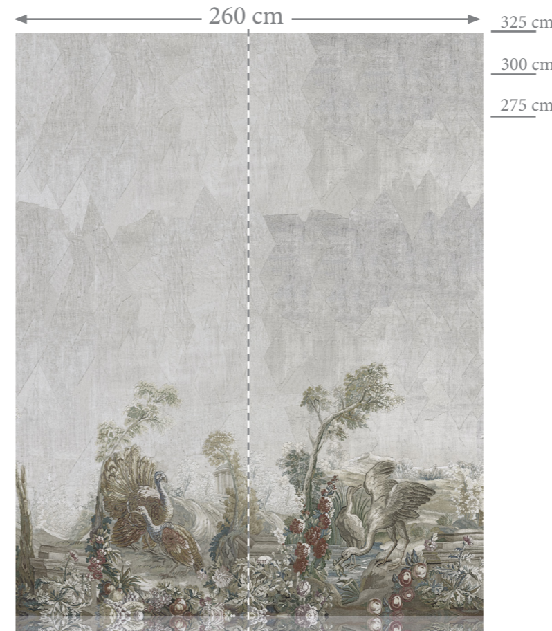
Drop A Drop B Turkeys & Herons ZF.0246.12

Le Carnaval des Animaux Colour: Alba Rosa Product Ref: ZF.0245.12/ZF.0246.12