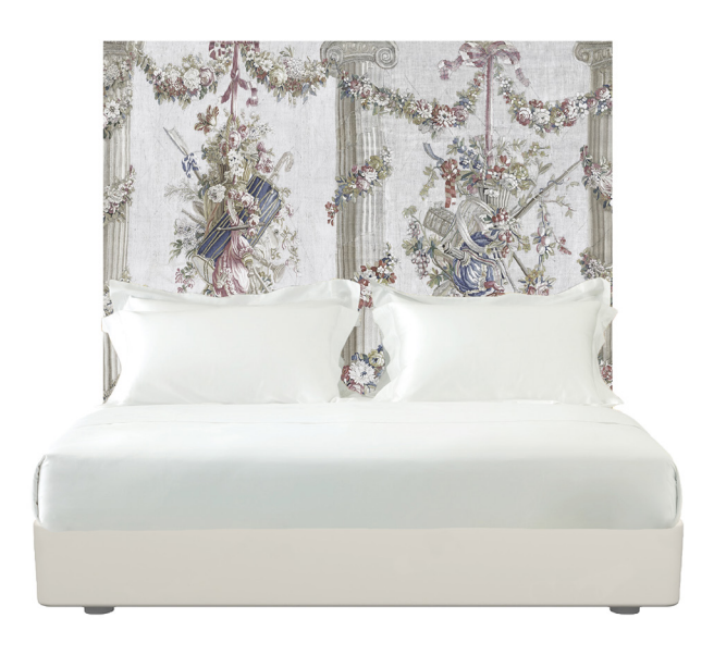
Example shown on a UK Super King size bed (180 cm wide)