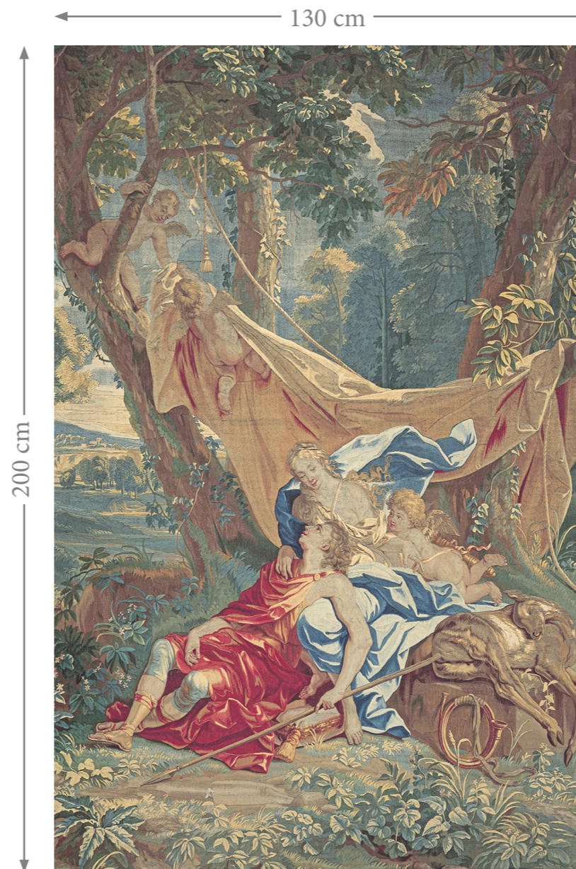
Drop A Venus & Adonis (Petite) Classic ZH.0267.01