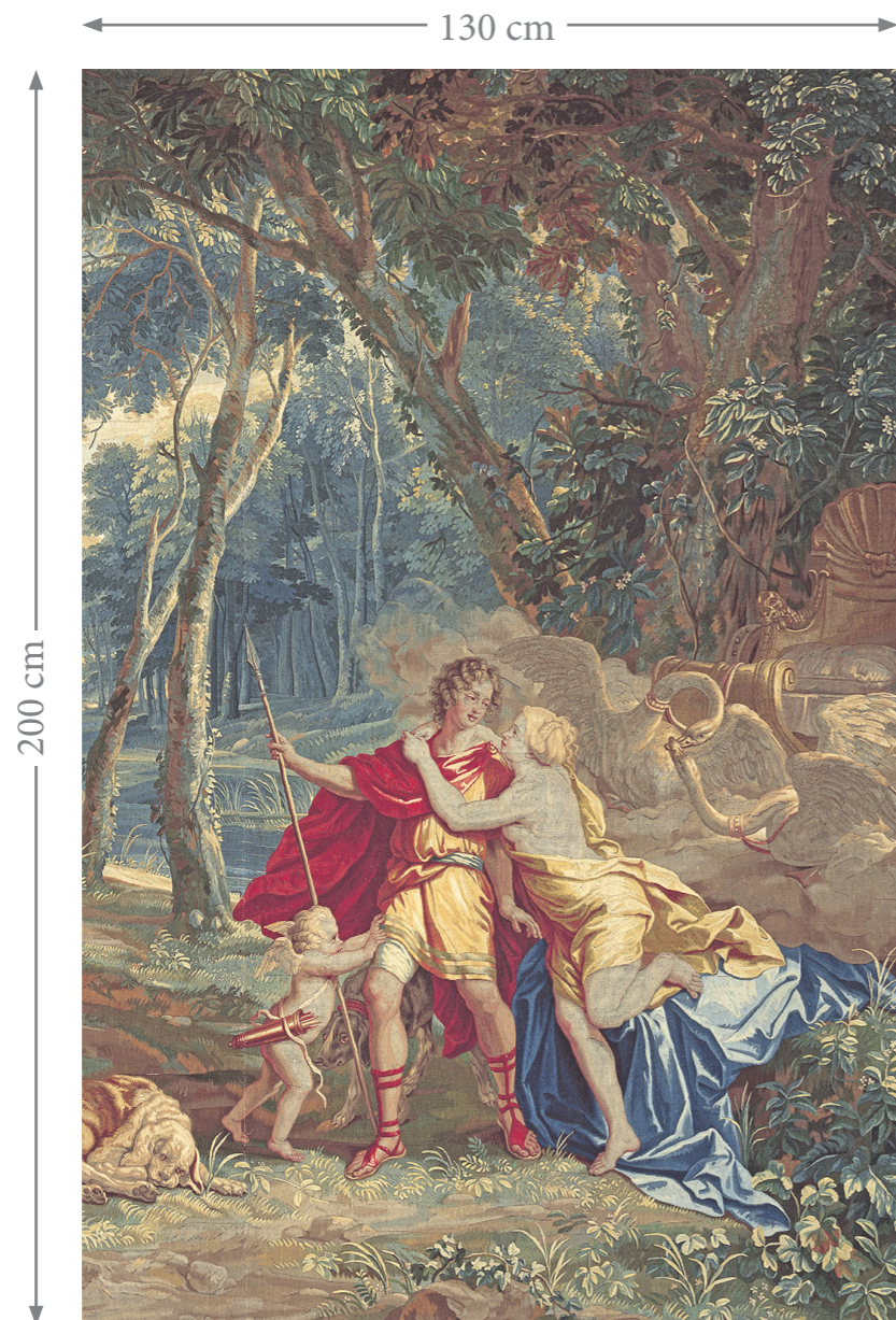
Drop A Venus, Adonis & Cupid (Petite) Classic ZH.0268.01